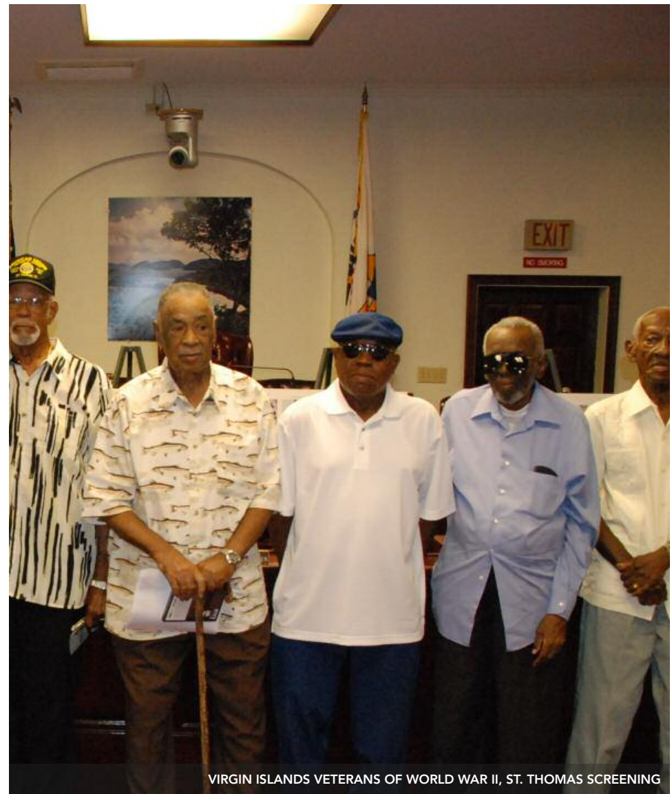
VIRGIN ISLANDS VETERANS OF WORLD WAR II, ST. THOMAS SCREENING

We need your support to finance this project. Specifically, we need to provide support to local, experienced professionals to produce a high quality DVD, as well as a stenographer to produce a transcript of the interviews with veterans to be sent to the Library of Congress. In addition there will be transportation expenses to interview veterans on St. Thomas and St. John as well as other basic production costs.