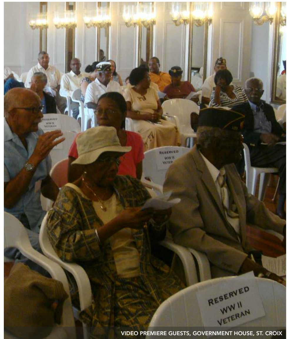
VIDEO PREMIERE GUESTS, GOVERNMENT HOUSE, ST. CROIX

For donations over $1,000, your support will be recognized in the credits shown at the end of the video and on the package encasing the DVD. You will receive a complimentary copy of the DVD as well as a personalized invitation to the premier showing of the video, with special VIP seating.